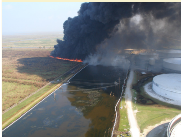
FIGURE 4. An oiled marsh being burned after Hurricane Katrina.

Figures 4, 5 and 6 show examples of ISB being used in an inland marsh, offshore and on ice.